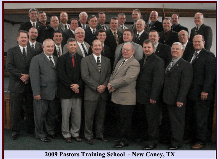
2009 Pastors Training School - New Caney, TX